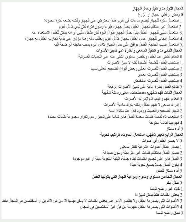
Figure1. Arabic version of APCEI profile

sworn translators/interpreters, fluent in both languages, recognized by the Consulate General of France in Tunisia. The APCEI profile was used in Arabic for the first time in Tunisia by the Rabta ENT service team (3), the one who translated and validated this Arabic version (Fig.1).